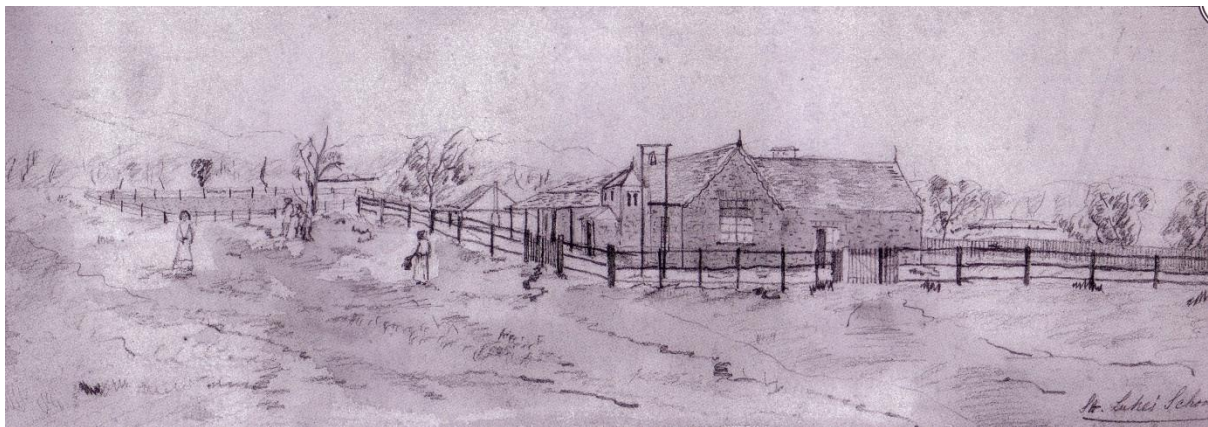
St Luke's Schoolhouse 1880