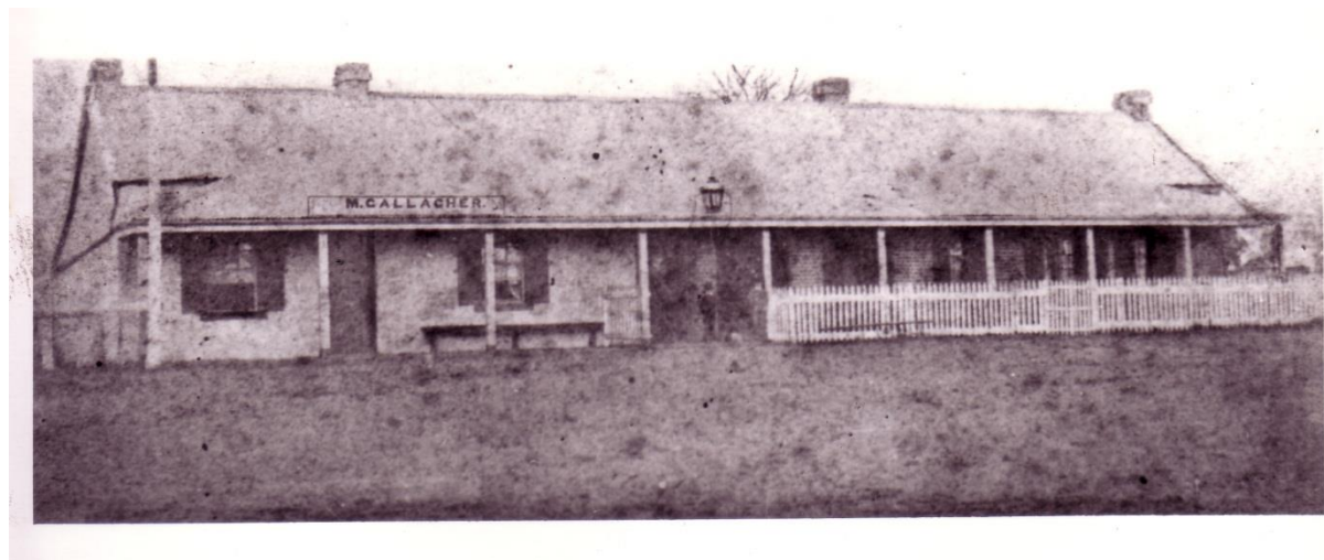
Gallagher's Railway Hotel 1884