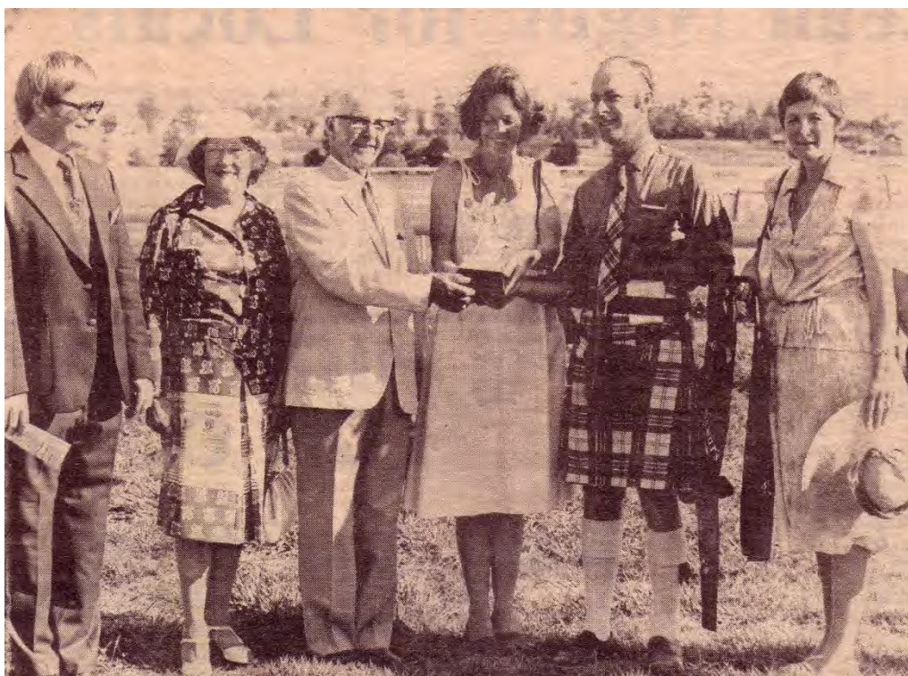
Presentation of the Dewars Progressive Cup, December 2 1978.