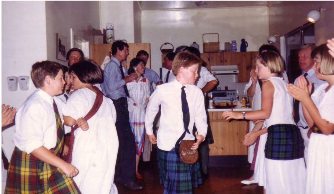
Hogmanay at 'Hepple Farm' Moobi, 1989.