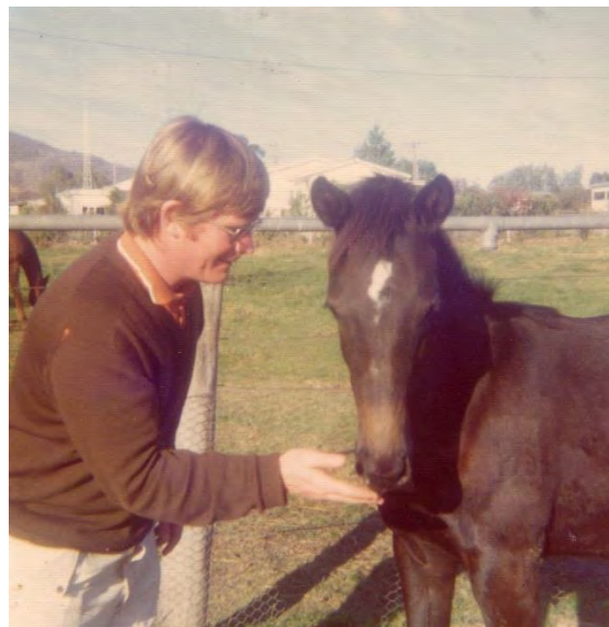
'Nurture or nature'