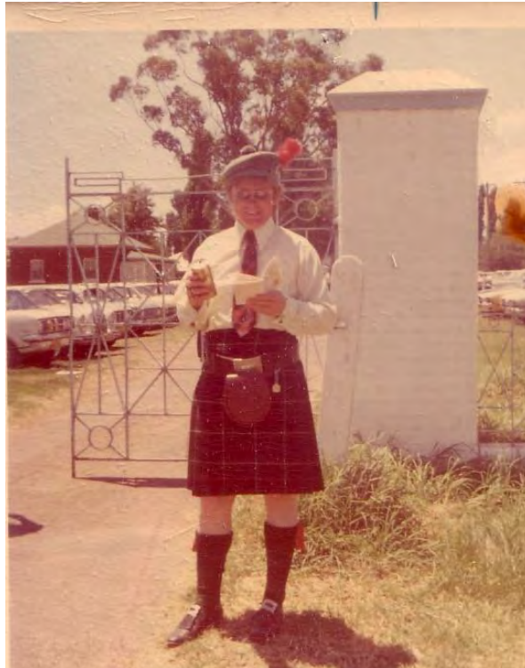
‘Sentry Duty’: St Andrews Race Day November 1974