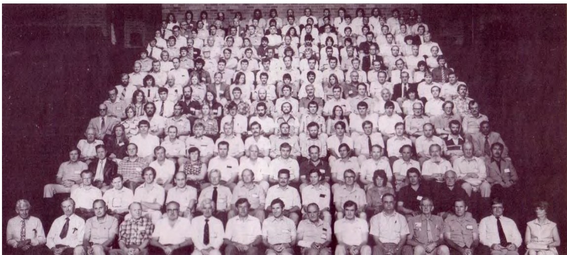
Delegates for 14 countries at the Third International Symposium on Equine Reproduction, Seymour Centre University of Sydney 1982.