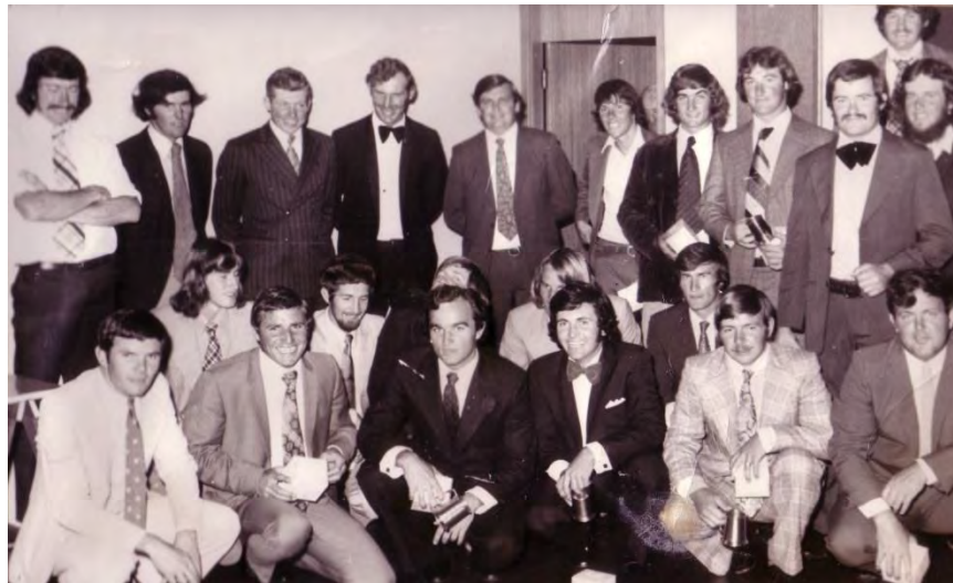
Scone Rugby Club Premiers 1975