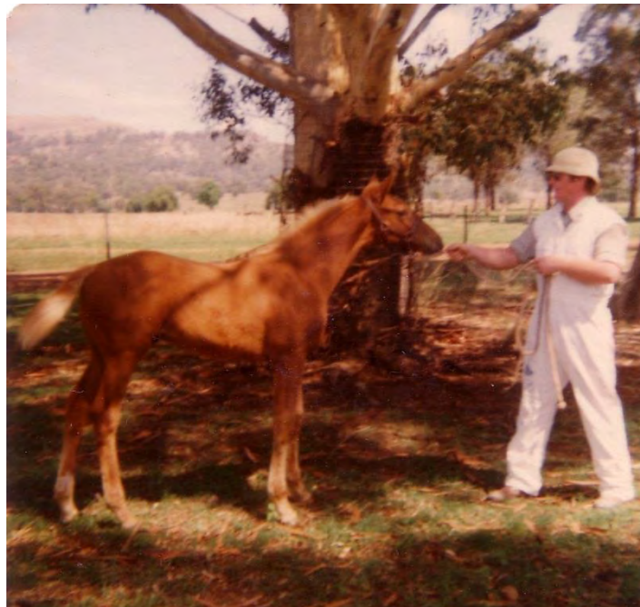
Bletchingly ex Breadline Chestnut Weanling Colt raced as Nioka Prince.