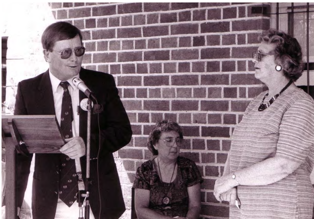
Scone Shire Citizen of the Year Award 1996