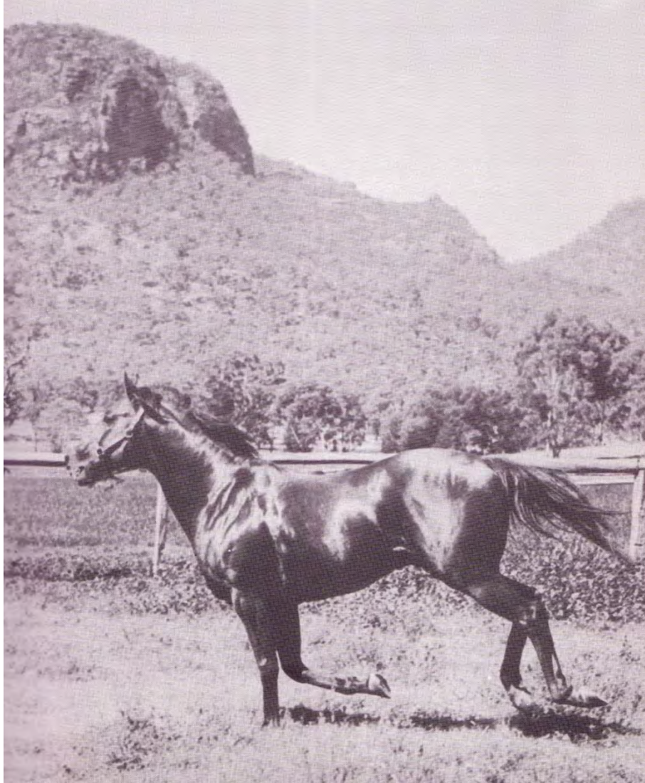
Star Kingdom at Baramul.