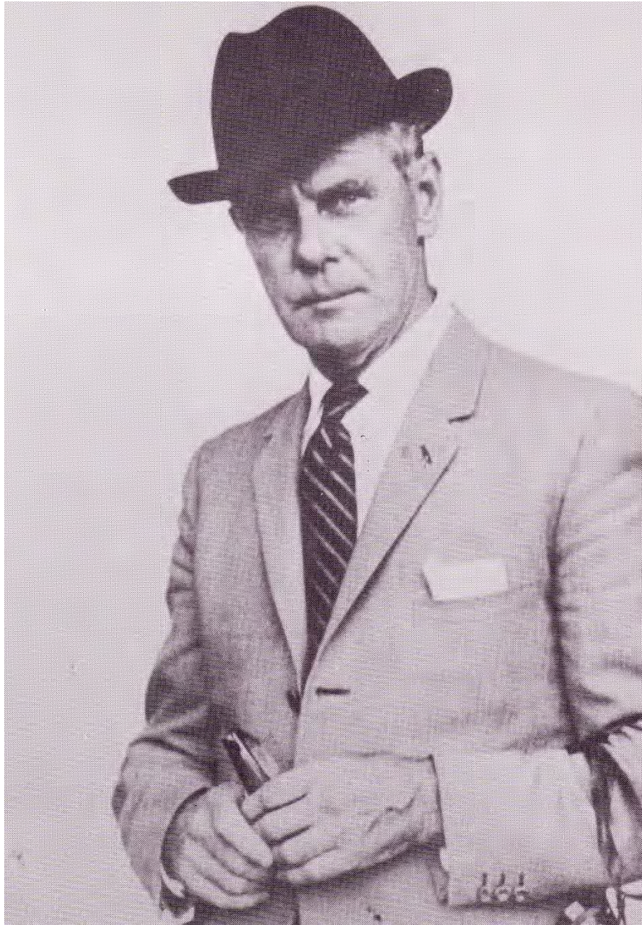
AOE at Flemington