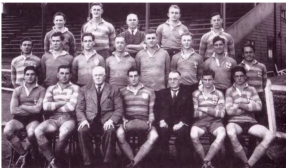
Sydney University First XV Premiers 1945