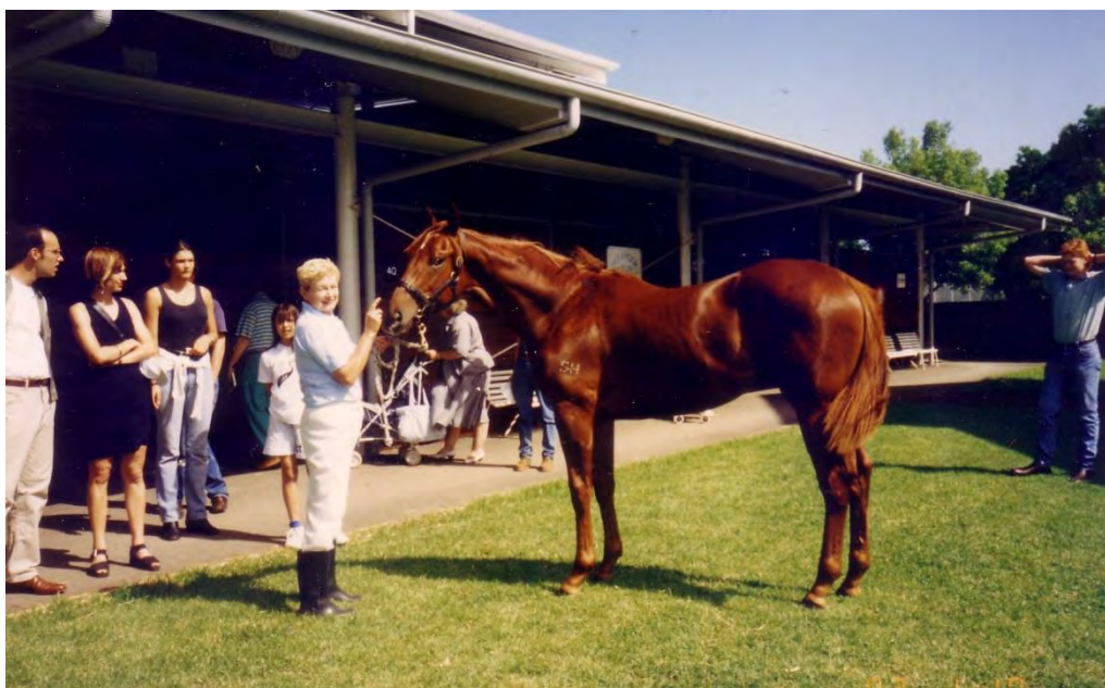
Huntingdale ex Marmara Yearling Filly at Newmarket 1994