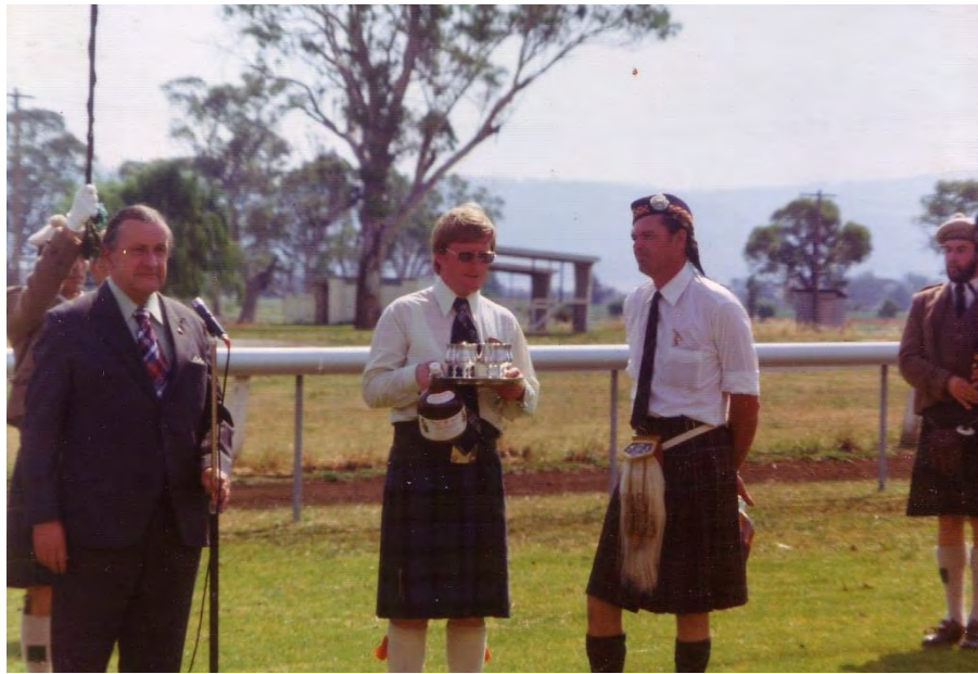
St. Andrews Day Race Meeting December 1974

Murray Bain Memorial Trophy presented by the author