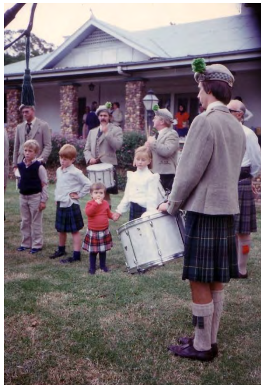
Three generations on the front lawn at Tinagroo Cardiff RSL Pipe Band on parade before the Patron.