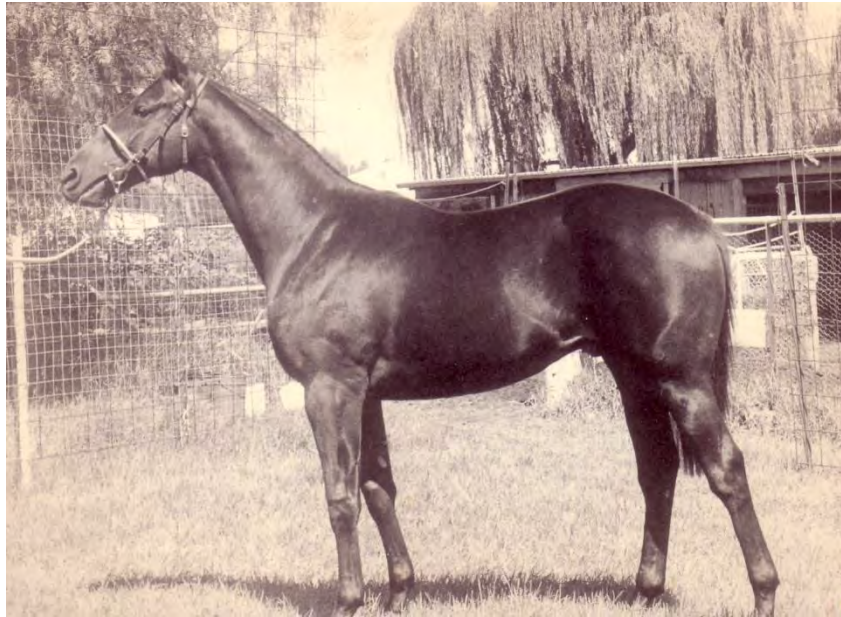
Yearling colt by Bletchingly ex Beyond All

$105,000.00 was a lot money in the early 1980's!