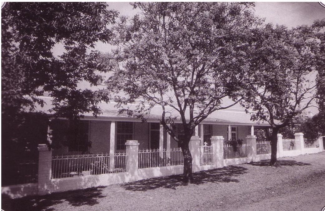
Chivers in 1968 - The 'practice' operated out of facilities at the rear of the main homestead. Access was from the New England Highway via a road at the far right of the picture.