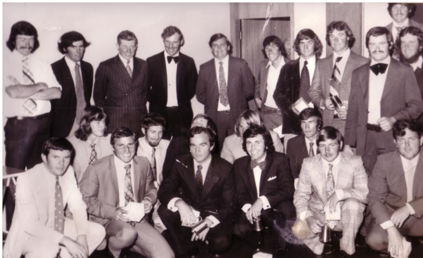
Scone Rugby Club Premiers 1975

At the time of writing (January 2006) there have been approximately 180 veterinarians operating short or long-term in Scone over a 50+year period from 1950. At present there are some 30+ veterinarians employed at various locations under the Scone Veterinary Hospital banner, including Denman. Many are specialists in their field. This figure does not include those engaged in private practice at Satur Veterinary Clinic or individuals employed on local studs. The cohort today is vastly different to the hard working, fast driving, hard playing, fast living and hard drinking good old 'rugger buggers' of yesteryear! The gender, generic and genetic core has endured a paradigm shift from the 'good old boys'. In a report I wrote for the 20 th anniversary of the Scone Rugby Union Club in 1986 I counted as many as 20 veterinarians who had represented the club as players many of whom excelled such as Bill Stewart who captained the zone. In 2005 I doubt if there was one sole player but I may be wrong? Neil McRea says the last veterinarian to represent Scone was Don Crosby in about 1990.