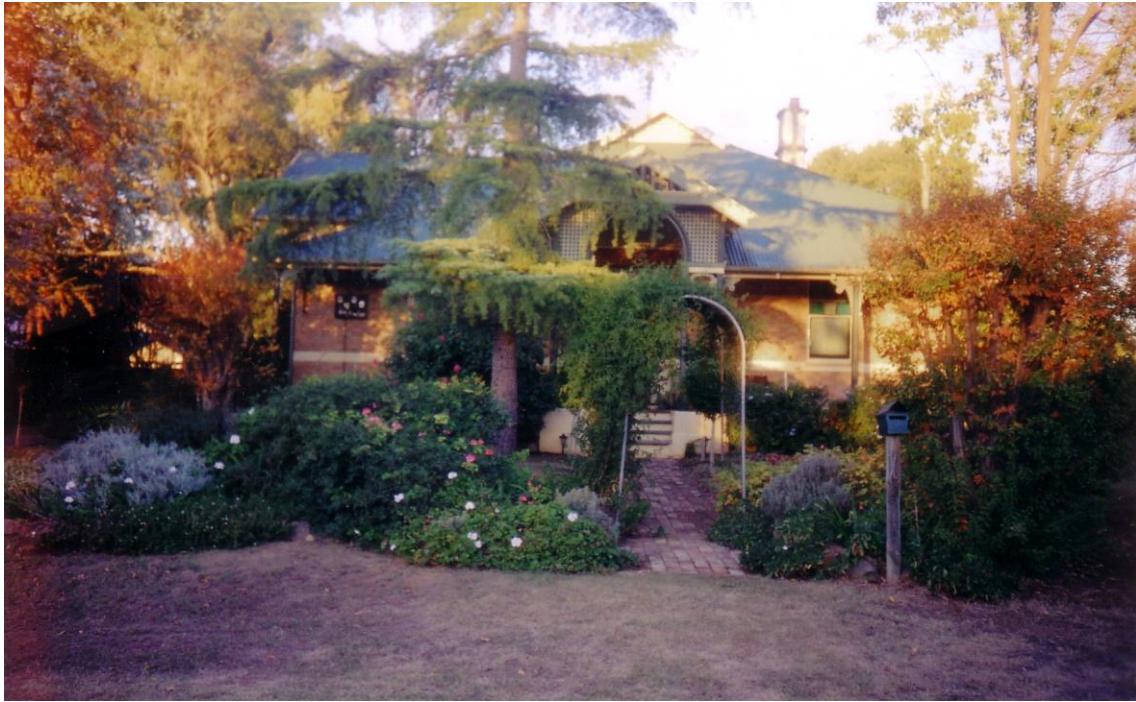
88 Main Street – Formerly the practice of Williams and Partners.